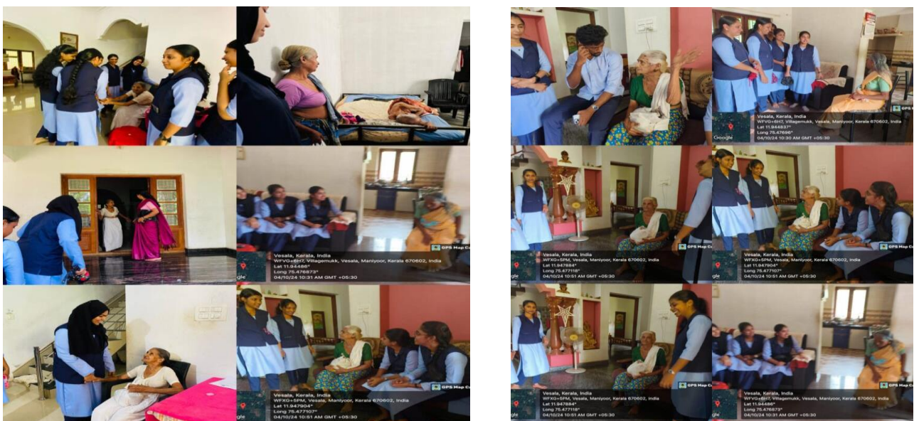
Oldage home visit 04-10-2024